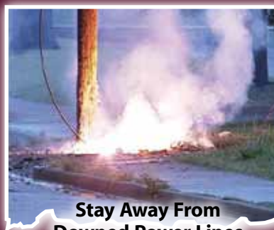
Stay Away From Downed Power Lines

Winter weather increases the chance of downed power lines. If you see a downed line, don't touch it! Keep others away and call us immediately. Only our employees have the equipment and knowledge required to correct the situation.